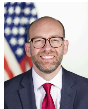
Russ Vought, Director of the Office of Budget & Management