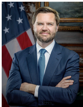
Vice President J.D. Vance