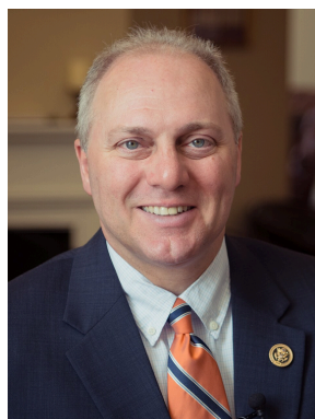
House Majority Leader Steve Scalise (R-LA)