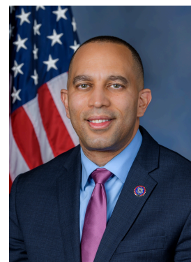
House Minority Leader Hakeem Jeffries (D-NY)