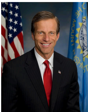
Senate Majority Leader John Thune (R-SD)