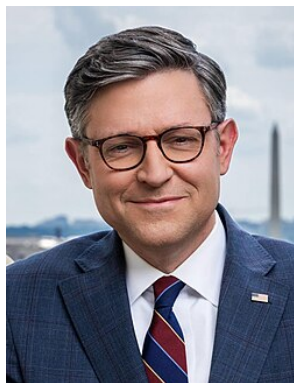
House Speaker Mike Johnson (R-LA)