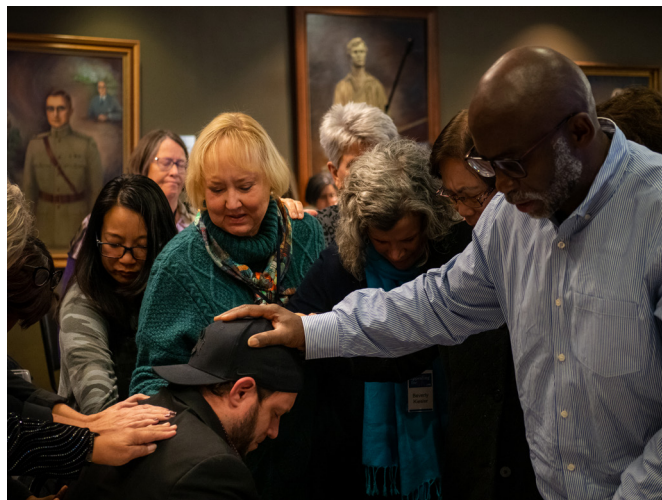
Intercessors pray over national leader at IFA event

be minimalized. We will no longer be persecuted. Our hearts will be filled with joy. We will receive excess riches from the nations.