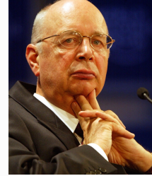
Klaus Schwab Founder World Economic Forum