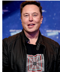
Elon Musk Inventor, businessman, currently the richest man in history