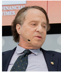
Ray Kurzweil Google Engineering Dir.