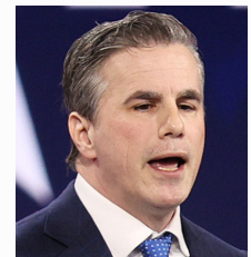
Tom Fitton Judicial Watch