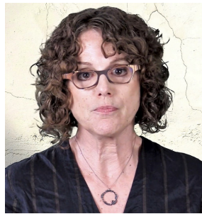
ROBIN DIANGELO AUTHOR OF "WHITE FRAGILITY"