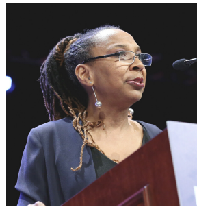
KIMBERLE CRENSHAW CRT SCHOLAR AND ORIGINATOR OF INTERSECTIONALITY