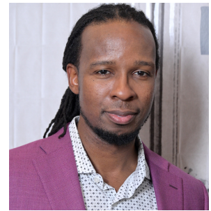
IBRAM X. KENDI CRT AUTHOR AND ACTIVIST