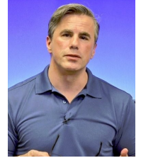
Tom Fitton Judicial Watch