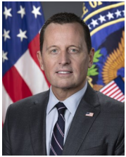
Richard Grenell Senior Advisor

There is a small group of fearless truth-seekers who have followed this story, spoken out at great risk, and took steps to reveal truth about the Russian narrative. Pray for each of them—for protection, for continued insight, and for a platform to share what truth they find. Some of them will be pursuing hearings and eventual justice.