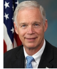
Ron Johnson Senator