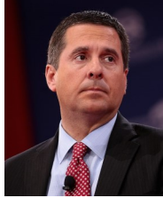
Devin Nunes Congressman