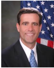
John Ratcliffe Dir. Nat. Intel.