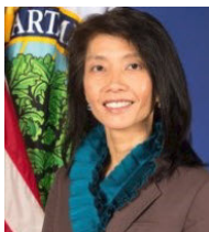
Holly Ham Department of Education