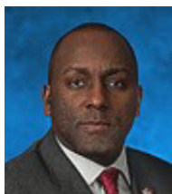
Conrad Washington Department of Veterans Affairs