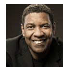
Denzel Washington Actor/Humanitarian