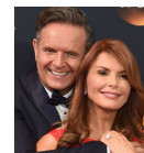
Mark Burnett & Roma Downey Producer & Actress