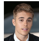
Justin Bieber Singer