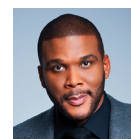
Tyler Perry Actor/Producer/ Entrepreneur