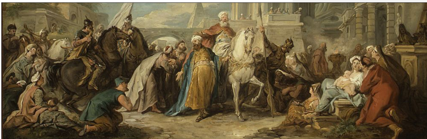
The Triumph of Mordecai - Jean François de Troy