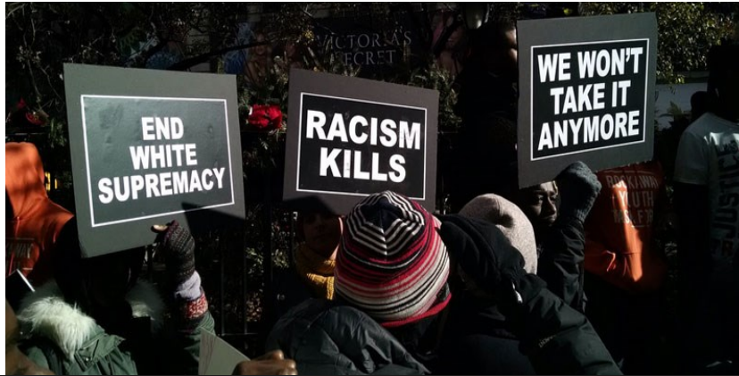
Black Lives Matter is just one of the groups funded by shadow funding groups.