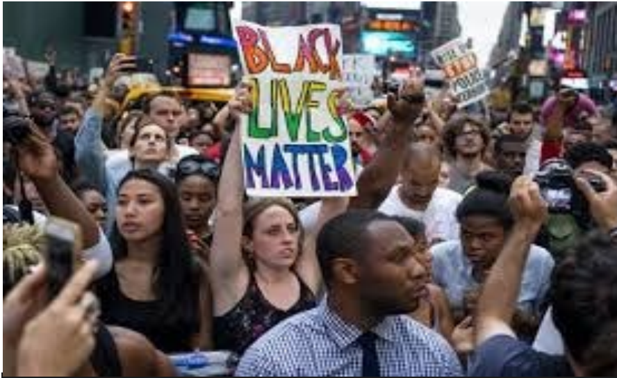
Black Lives Matter protestors in Dallas before sniper fire erupted July 7, 2016.