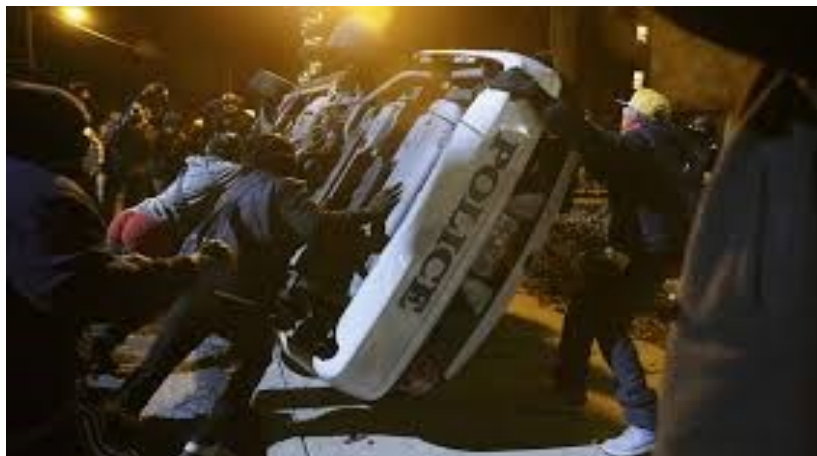
Rioters in Ferguson, Missouri, destroy a police vehicle.